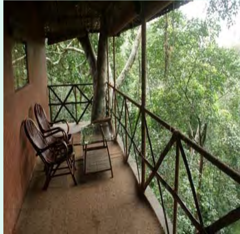
Tree house, Vythiri Resorts