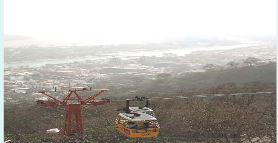
Ropeway to Mansa Devi Temple, Haridwar, Uttarakhand