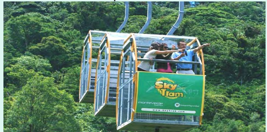
Sky tram at Monteverde