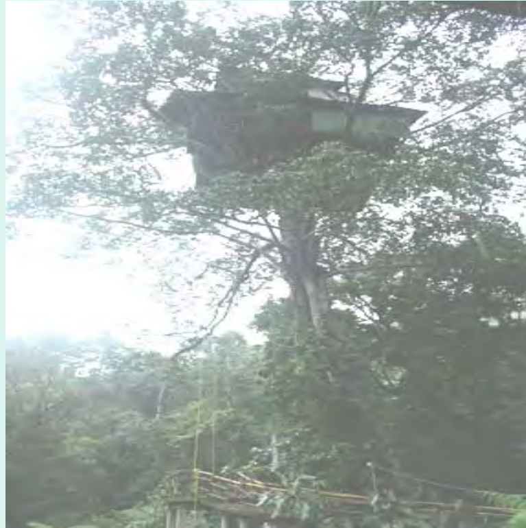
Jungle Park, Green Magic-1