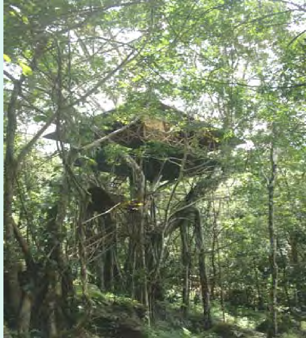
Tree house, Waynad